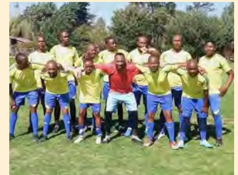
BGL Football Team at the Metropolitan Sports Day