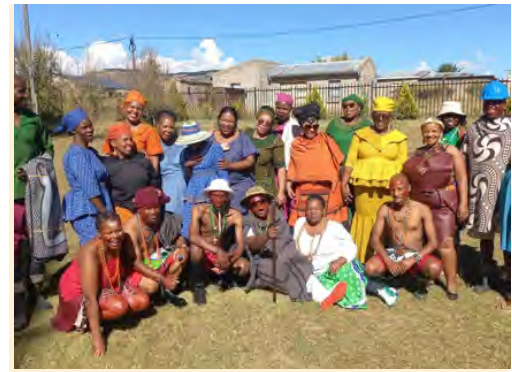
Staff celebrating Lesotho's 200 years!