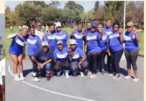
BGL Netball Team at the Metropolitan Sports Day